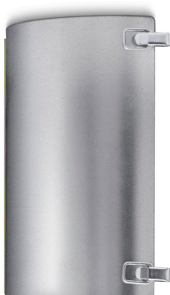
ROUND DUCT ACCESS DOOR

KEES curved duct access doors are designed to fit round or oval ducts of any diameter of 4" and larger. The uninsulated curved versions are offered in standard sizes with customized options available. Standard doors are suitable for low-to medium-pressure duct systems up to 6" w.g.